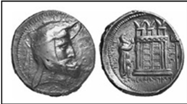
Figure 11. The coins of Vahbarz [63].

at the back the king standing praying in front of the holy structure as it says in Aramaic “Vahbarz, a divine Frataraka” (The Persian boy or Persian Frataraka?)” (Figure 11).