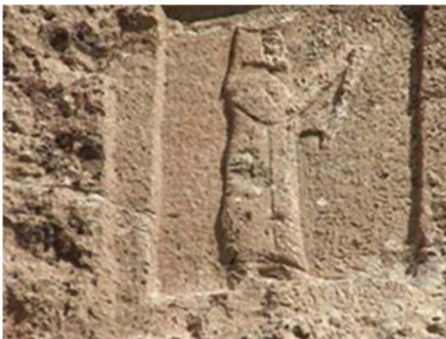
Figure 8. Dokan Davood Inscription [62].

The motif of worshiper is on every Frataraka coin, so that the Frataraka king personally depicts the worshiper in the embodiment of a big cleric. The worshiper wore a satrap hat and raised his hands for respect praying standing in front of the holy structure (Kaaba of Zoroaster). Debevoise [46] compares the motif of worshiper on Frataraka coins and the motif of Frataraka kings from Persepolis with the motif of Dukkan-e-Daud in Sarpol-e Zahab (Figure 8) and estimates it dates back to 150 B.C. – 250 B.C.