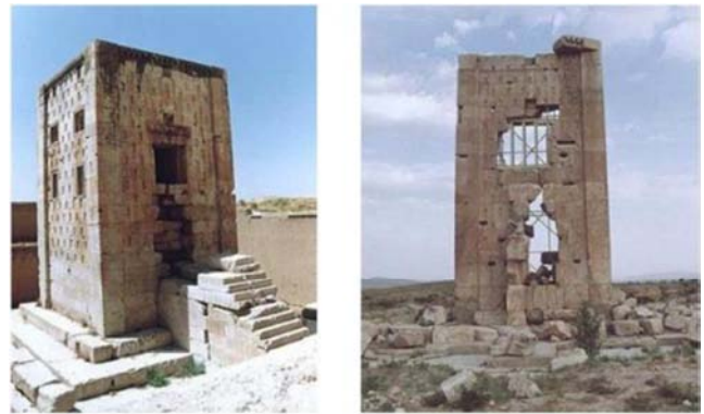
Figure 5. Kaaba of Zoroaster, Solomon Prison[62].

There are different assumptions for the structure of Kaaba of Zoroaster [38]. Erdman [39] suggests the structure identical to the motifs on Frataraka coins. Nevertheless, Stronach [40] describes the structure as a sample of post-Achaemenid fire temples. However, Dr Shahbazi [41] suggests the structure as the Fire Temple of Persepolis platform. The only prominent architectural work of Frataraka is a building discovered by Herzfeld [42] in 300 m Northwest of Persepolis platform and it became known as the Temple of Frataraka (Figure 6).