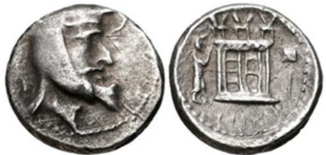
Figure 10. The coins of Artaxerxes I, NO 10874.

The coins of Artaxerxes I are similar to the second set of Bagadat coins on which the king standing praying in front of the holy structure and behind the coin the king introduces as "Artaxerxes, a divine Frataraka (The Persian boy or Persian Frataraka?)" "rhštr (y)/ prtrk' ZY'LHY/ br/(prs)" (Figure 10).