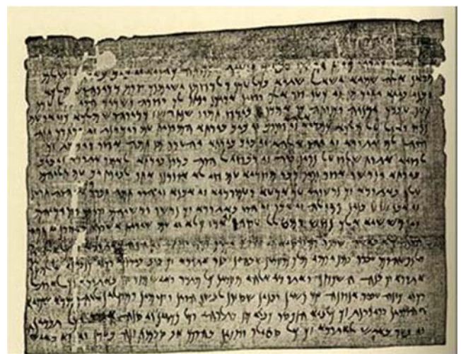
Figure 3. The Aramaic Papyri of Elephantine [31].

The Bagadat coins introduces the king as they said "bgdprtrk' ZY' LHY' BR bgwrt" (Bagadat, a heavenly Frataraka, the son of Bgwrt). Naster has carried out some