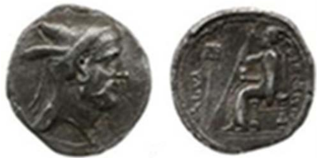
Figure 1. Bagadat [60].

Bagadat coins have minted in two different sets. The first set (Figure 1) is considerably different from the other Frataraka coins in type and design. The second set is more like other coins of Frataraka kings and Alram [30] believes that this set is newer than the coins of the current king (Figure 2).