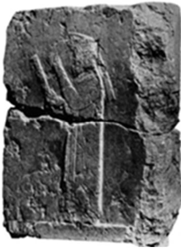
Figure 7. Frataraka reliefs, pl. III: b [46].

Shenkar [43] describes the reason of its attribution to the Frataraka kings as it is not a part of Persepolis royal set and it has three bases of pillar of which two bases reused after the destruction of platform and the third base is cubic which was not common in architecture of Persepolis. Tilia [44] suggests that the Frataraka constructed monuments in Persepolis. Roaf [45] following Tilia research, guesses that a Frataraka ruler possibly lived at the post-Achaemenid residence located at the south corner of Persepolis platform. However, the most important reason is a Frataraka motif, which clearly resembles the worshiper at the back of Frataraka coins (Figure 7).