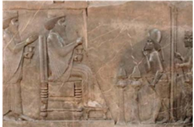
Figure 4. Achaemenid reliefs [62].