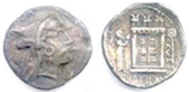
Figure 2. Bagadat. NO 10873 [61].