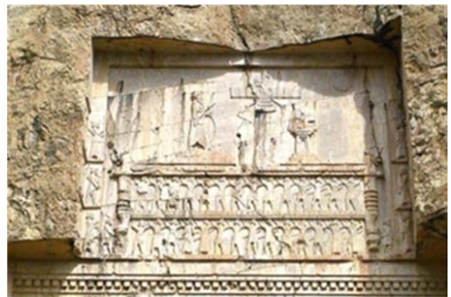
Figure 13. Tomb of Darius the Great at Naqsh-i Rostam [62]

so that the symbol used extensively [47]. Avesta describes the symbol as the Holy Spirit and savior of the world, which exists everywhere, it is a symbol of spiritual power and supporter of Iranian kings, and it is placed over the head of king [56]. Farvahr is an internal sacred force appeared as a shining man with two wings and rings and it is an ancient national Iranian symbol [57]. Most researchers of Ancient Iran suggest the Farvahr or the winged man as the symbol of Ahiura Mazda [58, 59, 47]. The motif considered one of the important reasons in full independence of Persis during Autophradates ruling era, Calmeyer and Shahbazi believe that the crown of winged man is different from the king's hat as the former is typically from the Achaemenid crenate crowns, though the king wore a satrap hat. The image at the back of Autophradates I coins represents the motif of the Darius I at Naqsh-e Rostam monument in which the trinity of the king praying holding a bow in his hand, a fire altar and the winged man has been depicted (Figure 13).