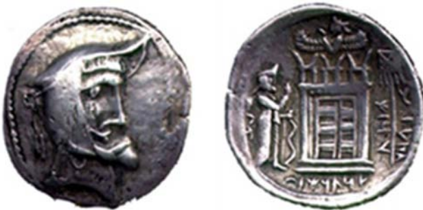
Figure 12. The coins of Autophradates I/ Vafhradad I, NO 10875 [61].

Autophradates is the last king of the first Persis rulers. The coins introduce the king as they say “Autophradates, the divine Frataraka” (wtprdt/ prtrk' ZY 'LHY'/br) (Figure 12).