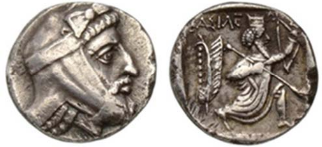
Figure 9. the king sent a nobleman named Tissaphernes to Lydia [2].

The satrap hat of worshiper, which is on Frataraka king's head and minted on post-Bagadat coins, is a typical felt hat protruding forehead and covering neck and face which covers all the lower face. It protects the sacred fire from pollution of breath. The edges pull up a little, during religious ceremonies to cover the mouth. However, all parts of the hat are integrated. The hat represents all the kings of Frataraka, which completely resembles the hat on Achaemenid coins. The satrap hat motif minted on four-dirham coins of Tisaferm satrap of Lydia and Caria at late fifth century B.C. in Asia Minor (Figure 9).